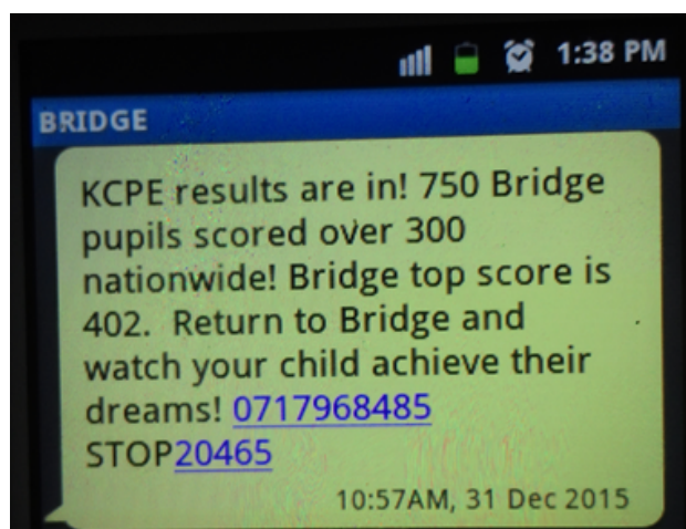
Text sent by Bridge celebrating its KCPE results, 31 December 2015.

In 2015, the first group of BIA pupils sat the Kenya Certificate of Primary Education (KCPE), the national primary school exit exam 60 . Since then, BIA has celebrated annually what it refers to as its above average examination results. In 2020, it announced that it had 'excelled for five consecutive years now in the government's national primary school exit exam—consistently performing above the national average' 61 , and emphasised the correlation between time spent at Bridge and good examination results 62 .